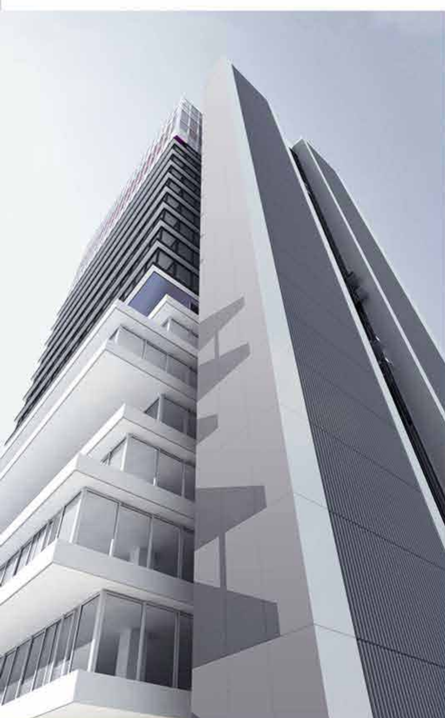
CITY HALL 26.000m 2 $90 million USD