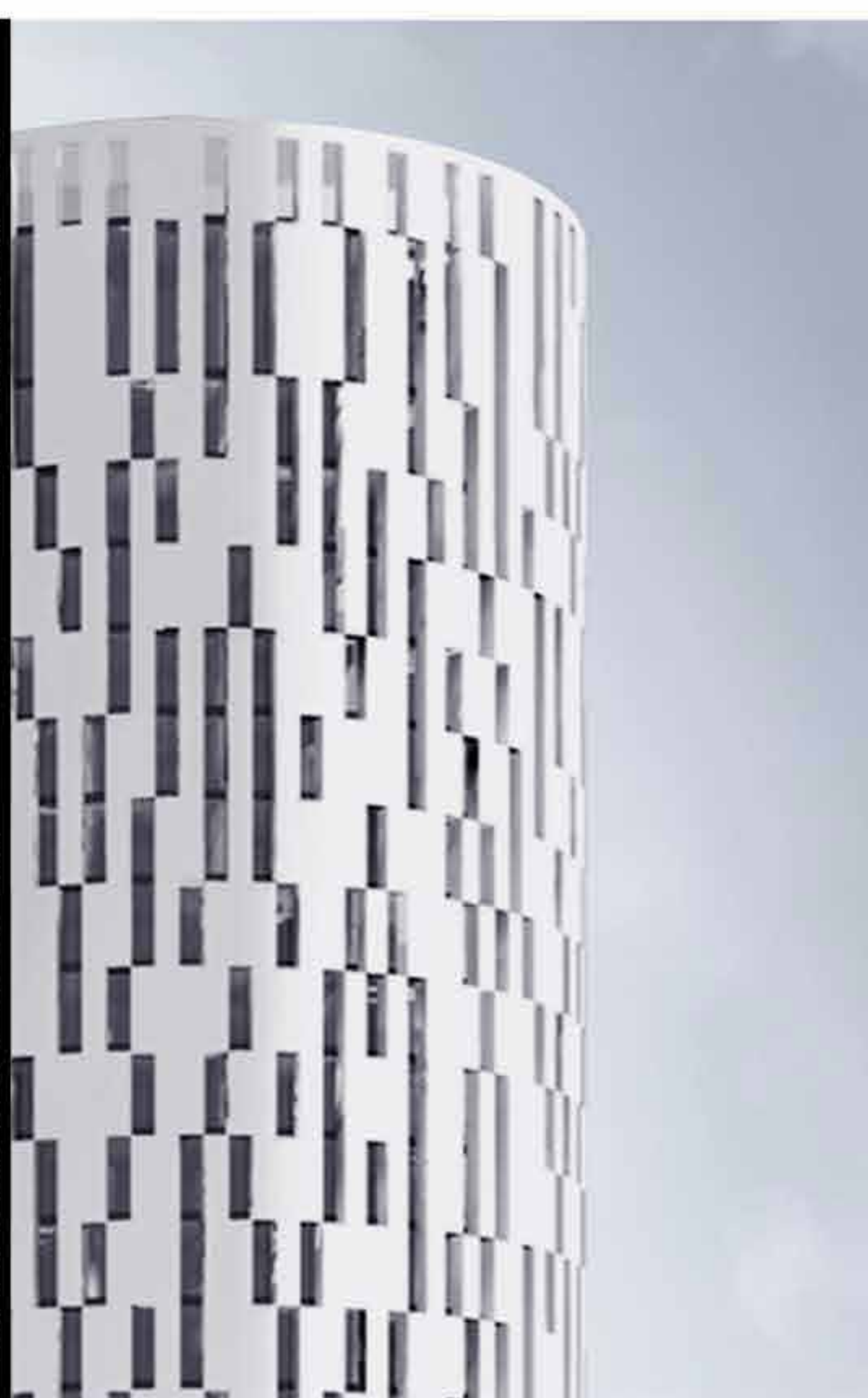
HOTEL SHERATON 33.500m 2 $60 million USD