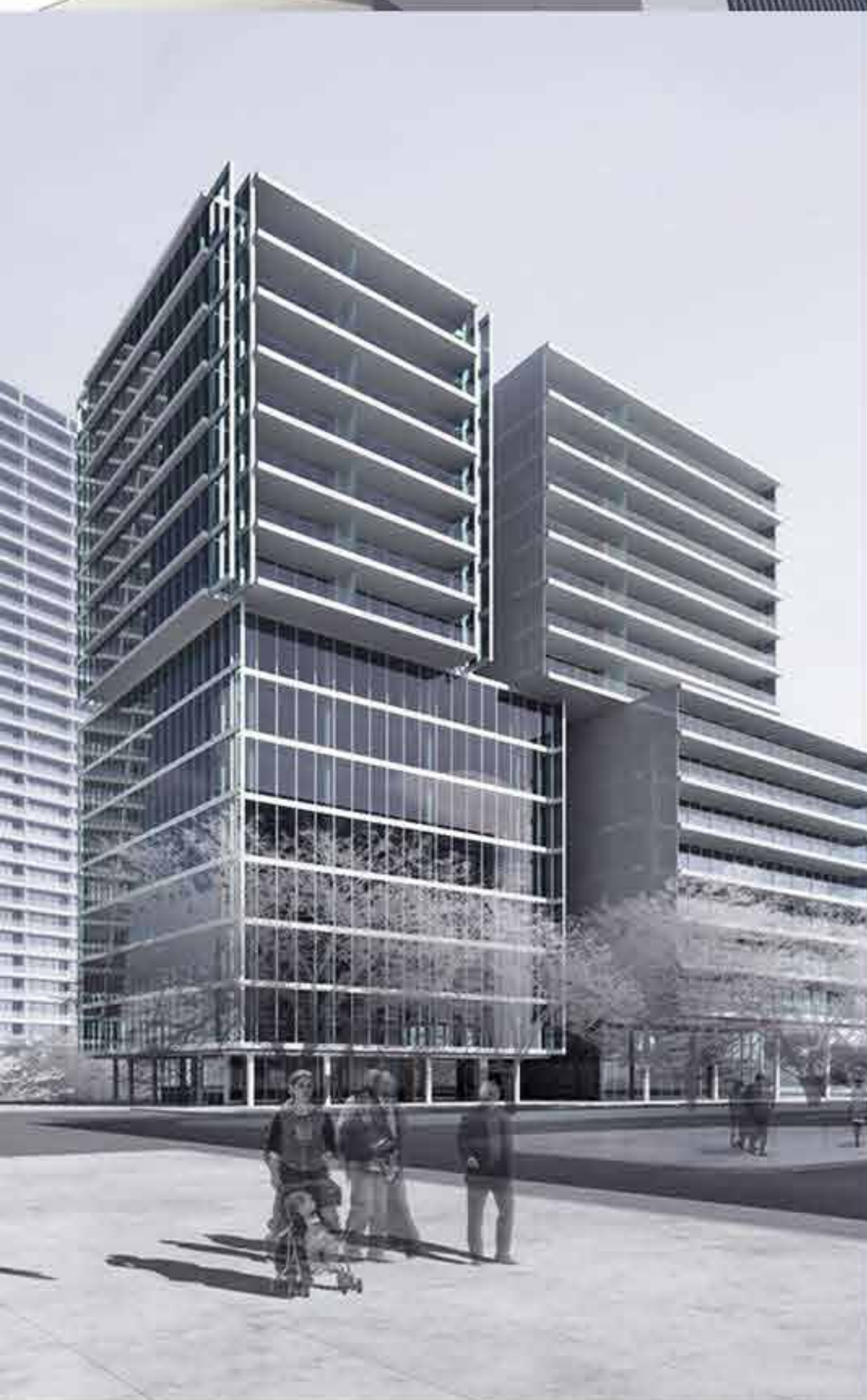
PARKVIEW 29.400m 2 $45 million USD