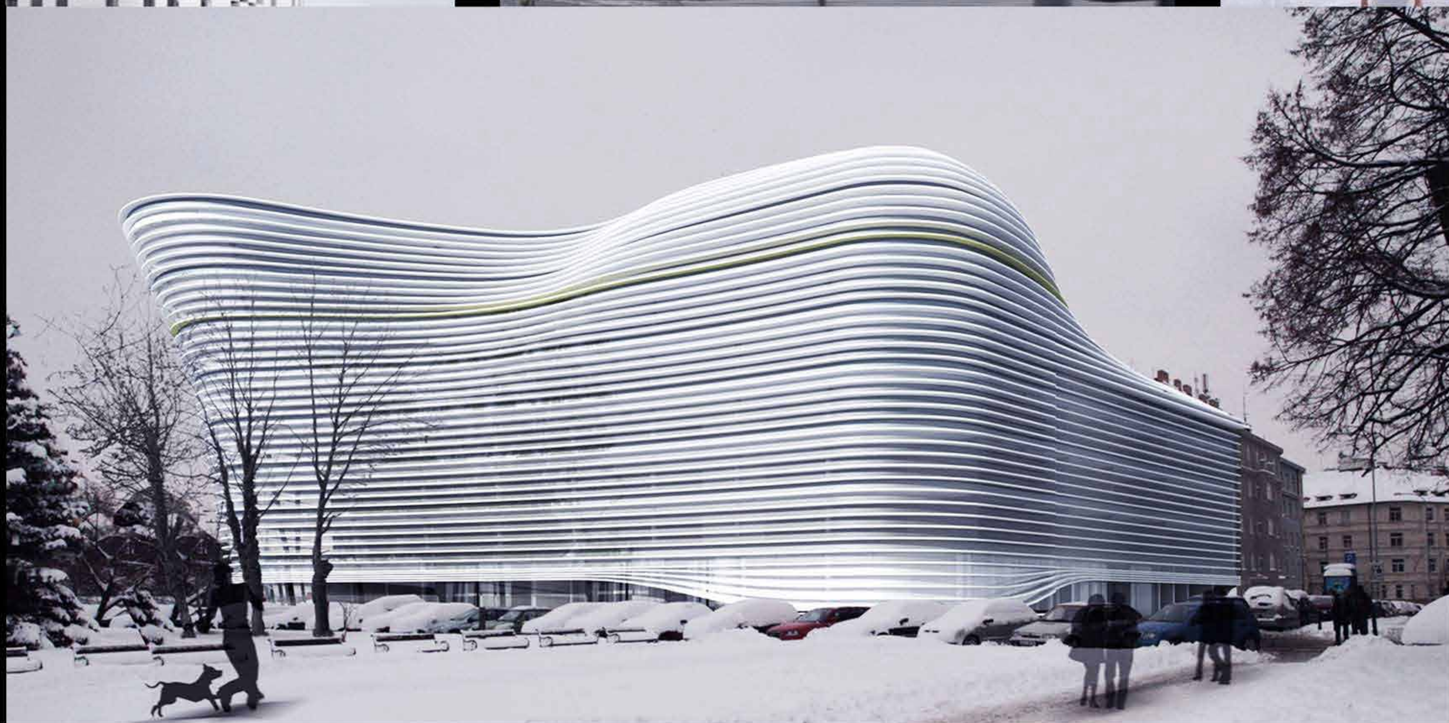
DEJVICE 29.500m 2 $50 million USD