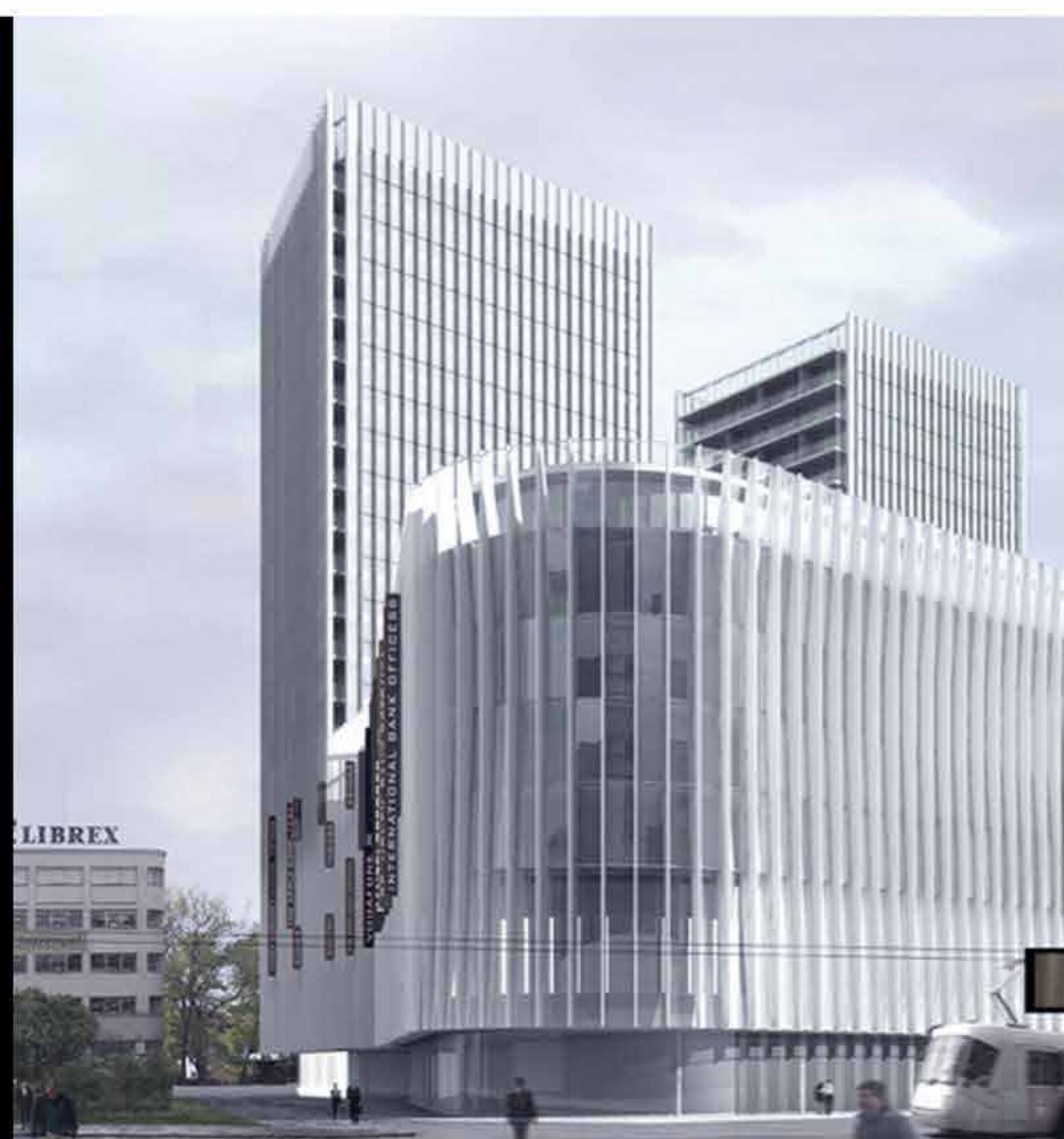
OSTRAVA 106.600m 2 $180 million USD